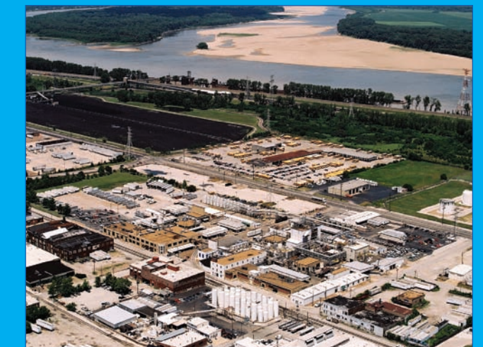
ELANTAS PDG, Inc. headquarters in St. Louis, Missouri

ELANTAS Electrical Insulation companies are strategically located throughout the world to meet the primary insulation, secondary insulation and electronic and engineering materials needs of our customers.