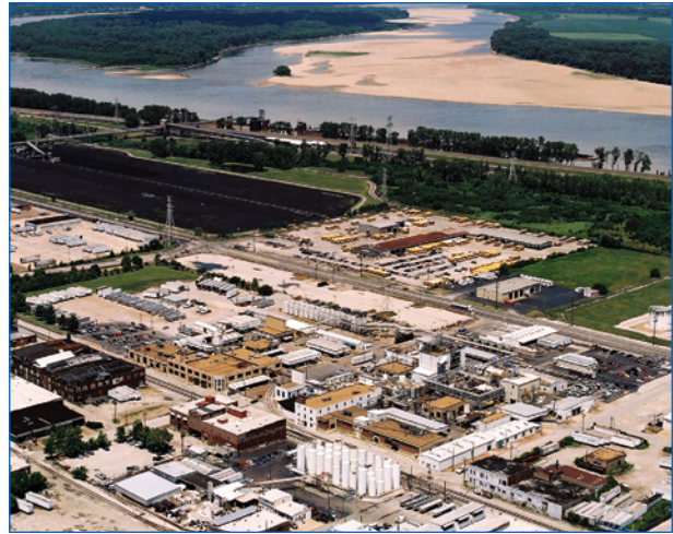
ELANTAS PDG, Inc. headquarters in St. Louis, Missouri

ELANTAS Electrical Insulation companies are strategically located throughout the world to meet the primary insulation, secondary insulation and electronic and engineering materials needs of our customers.