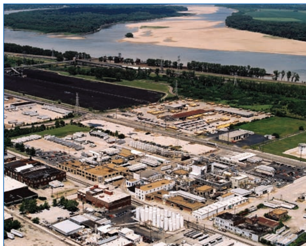
ELANTAS PDG, Inc. headquarters in St. Louis, Missouri

ELANTAS Electrical Insulation companies are strategically located throughout the world to meet the primary insulation, secondary insulation and electronic and engineering materials needs of our customers.